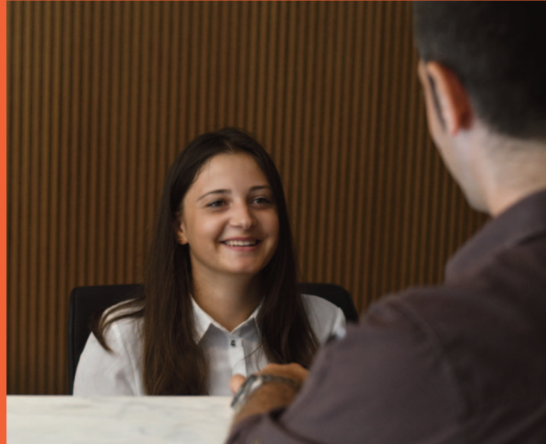
EasySL Interns at their workplace.