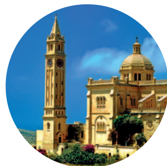
Ta' Pinn Church