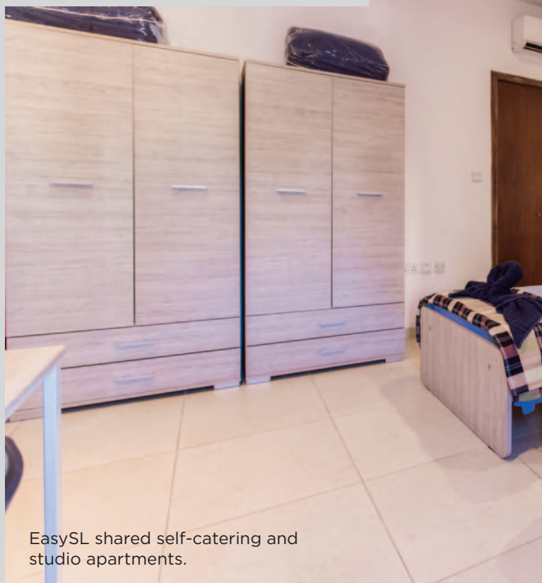
EasySL shared self-catering and studio apartments.

If you prefer a private option, our studio apartments would be the best option. We have a