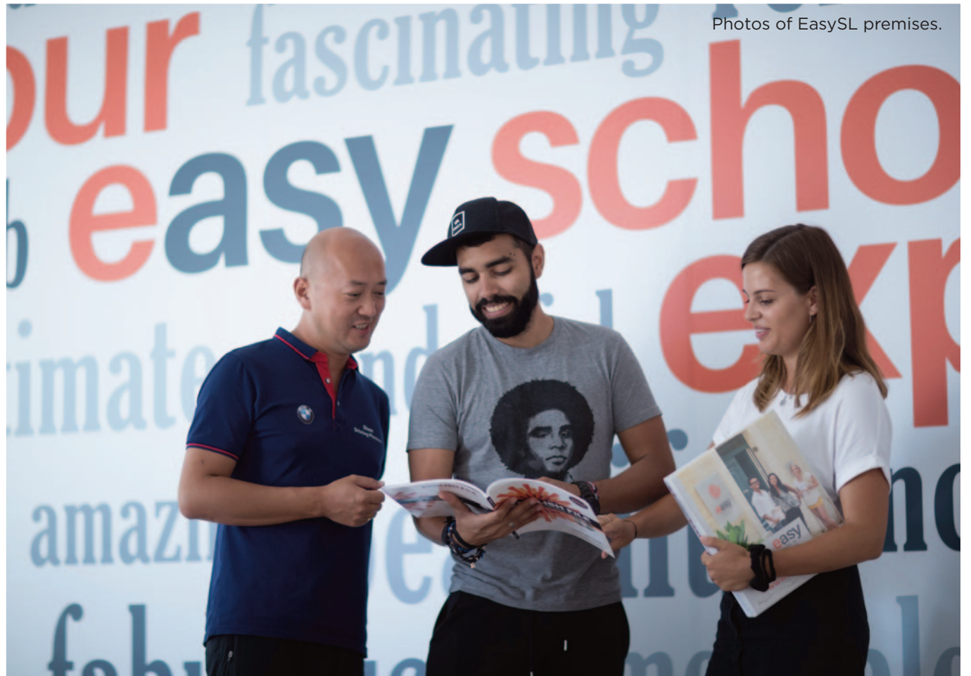
Photos of EasySL premises.