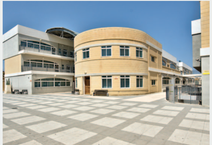
EasySL Junior School.