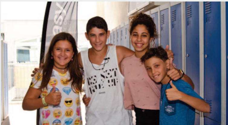
EasySL Junior School students.