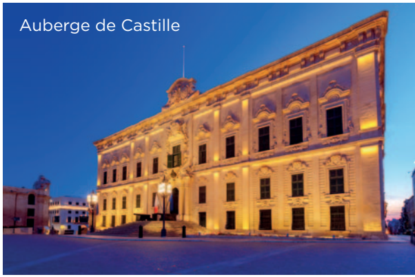
Auberge de Castille