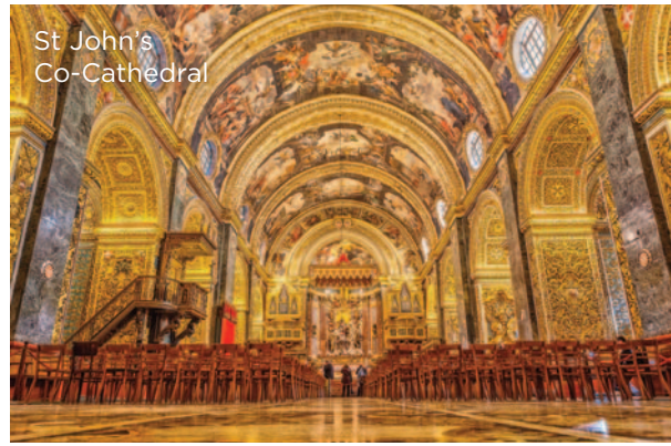
St John's Co-Cathedral