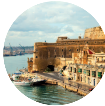
Valletta Grand Harbour