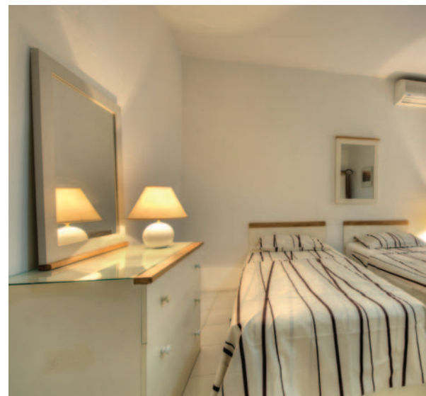
Easy School shared self-catering apartments.